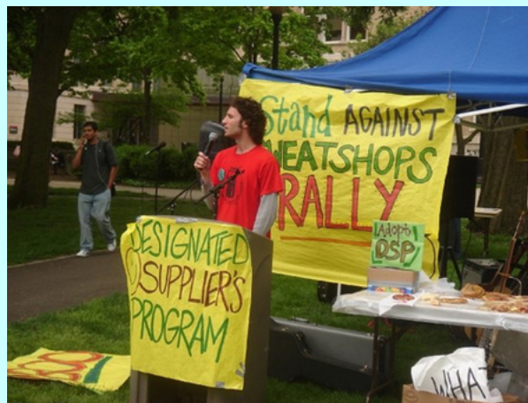
Figure 10.7 This protester seeks to bring attention to the issue of sweatshops.

Most of us don't pay too much attention to where our favorite products are made. And certainly when you're shopping for a college sweatshirt or ball cap to wear to a school football game, you probably don't turn over the label, check who produced the item, and then research whether or not the company has fair labor practices. But for the members of USAS—United Students Against Sweatshops—that's exactly what they do. The organization, which was