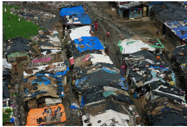
Figure 10.6 Slums in India illustrate absolute poverty all too well.

Subjective poverty describes poverty that is composed of many dimensions; it is subjectively present when your actual income does not meet your expectations and perceptions. With the concept of subjective poverty, the poor themselves have a greater say in recognizing when it is present. In short, subjective poverty has more to do with how a person or a family defines themselves. This means that a family subsisting on a few dollars a day in Nepal might think of themselves as doing well, within their perception of normal. However, a westerner traveling to Nepal might visit the same family and see extreme need.