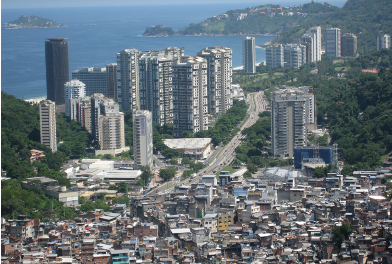
Figure 10.1 Contemporary economic development often follows a similar pattern around the world, best described as a growing gap between the have and have-nots.