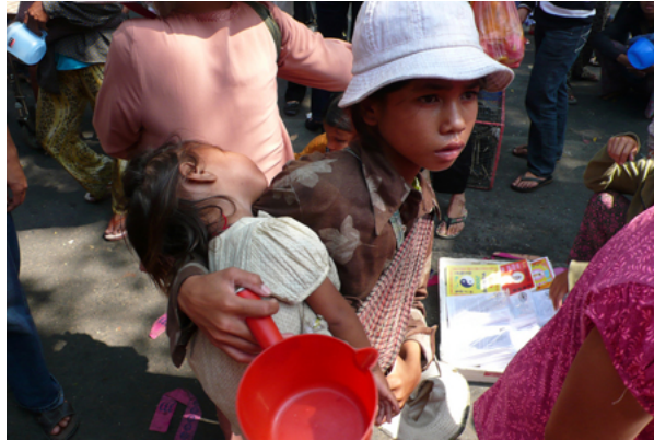
Figure 10.5 How poor is poor for these beggar children in Vietnam?

What does it mean to be poor? Does it mean being a single mother with two kids in New York City, waiting for the next paycheck in order to buy groceries? Does it mean living with almost no furniture in your apartment because your income doesn't allow for extras like beds or chairs? Or does it mean having to live with the distended bellies of the chronically malnourished throughout the peripheral nations of Sub-Saharan Africa and South Asia? Poverty has a thousand faces and a thousand gradations; there is no single definition that pulls together every part of the spectrum. You might feel you are poor if you can't afford cable television or buy your own car. Every time you see a fellow student with a new laptop and smartphone you might feel that you, with your ten-year-old desktop computer, are barely keeping up. However, someone else might look at the clothes you wear and the calories you consume and consider you rich.