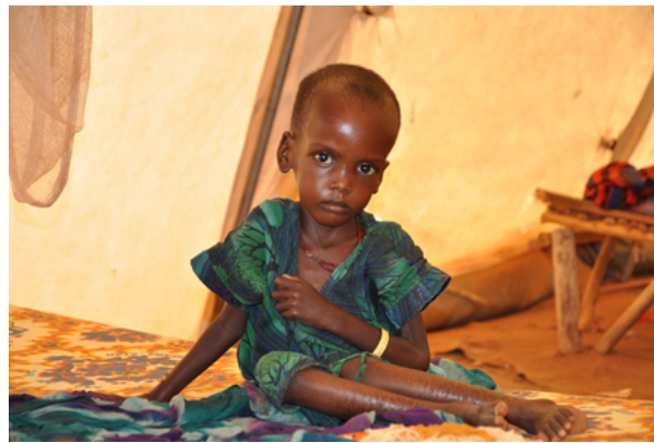
Figure 10.8 For this child at a refugee camp in Ethiopia, poverty and malnutrition are a way of life.

Not surprisingly, the consequences of poverty are often also causes. The poor often experience inadequate healthcare, limited education, and the inaccessibility of birth control. But those born into these conditions are incredibly challenged in their efforts to break out since these consequences of poverty are also causes of poverty, perpetuating a cycle of disadvantage.