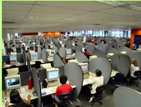
Figure 10.4 Is this international call center the wave of the future?