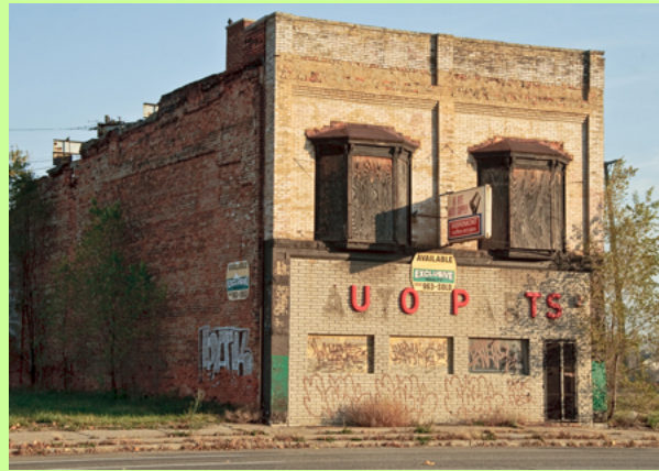
Figure 10.3 This dilapidated auto supply store in Detroit is a victim of auto industry outsourcing.

Capital flight describes jobs and infrastructure moving from one nation to another. Look at the U.S. automobile industry. In the early twentieth century, the cars driven in the United States were made here, employing thousands of workers in Detroit and in the companies that produced everything that made building cars possible. However, once the fuel crisis of the 1970s hit and people in the United States increasingly looked to imported cars with better gas mileage, U.S. auto manufacturing began to decline. During the 2007–2009 recession, the U.S. government bailed out the three main auto companies, underscoring their vulnerability. At the same time, Japanese-owned Toyota and Honda and South Korean Kia maintained stable sales levels.