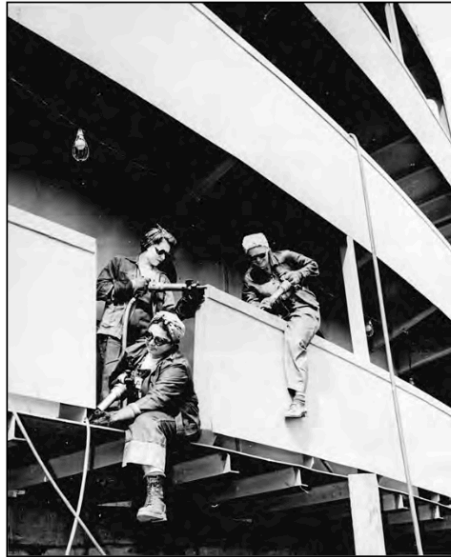
Source: "Women workers chipping paint," Marinship Corp., National Archives, 1942