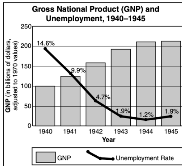
Source: Historical Statistics of the United States , U.S. Bureau of the Census