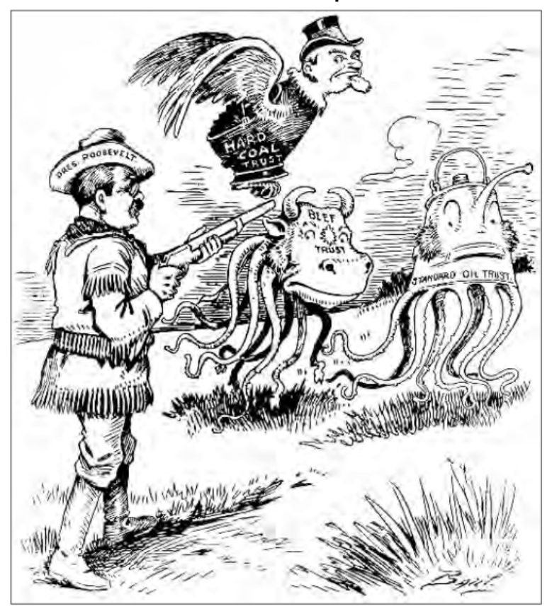
Source: Charles Bartholomew, The Minneapolis Journal , April 13, 1903 (adapted)