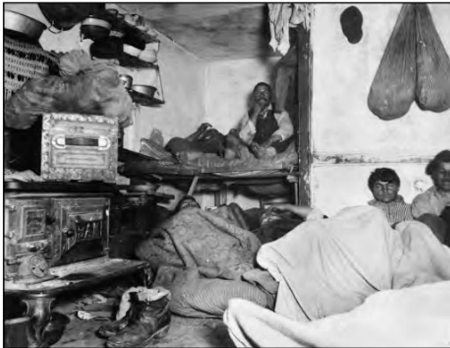
Source: Jacob Riis, How the Other Half Lives , 1890

14. One reason Jacob Riis published many photographs similar to this was to