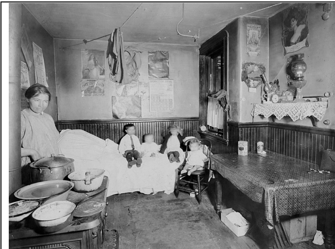
Image 1: "Family in room in tenement house," Jessie Tarbox Beals, 1910

Question 2 is based on the following images from the late 1800s and early 1900s.