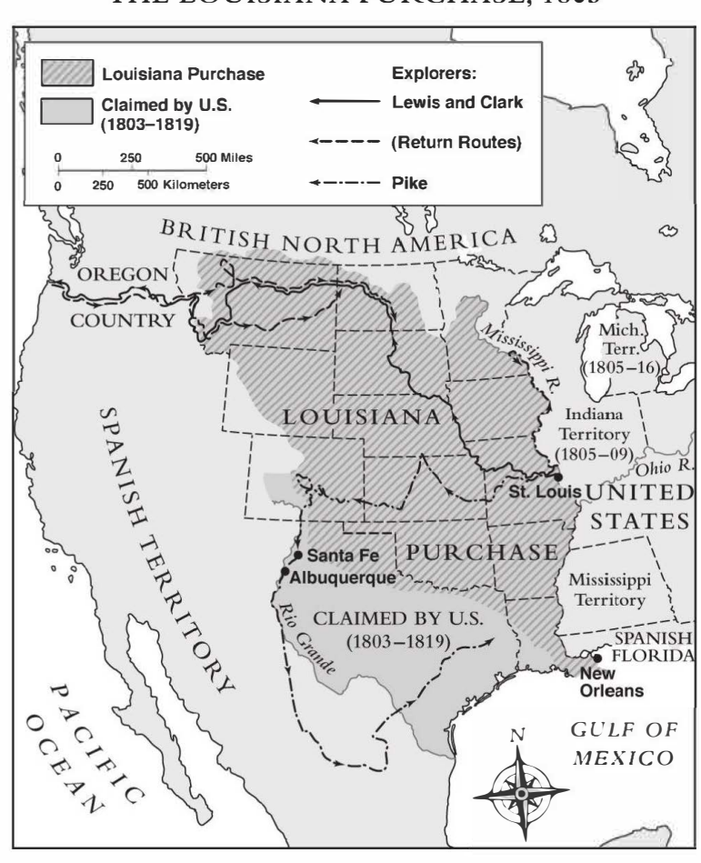
THE LOUISIANA PURCHASE, 1803

Consequences The Louisiana Purchase more than doubled the size of the United States, removed a European presence from the nation's borders, and extended the western frontier to lands beyond the Mississippi. Furthermore, the acquisition of millions of acres of land strengthened Jefferson's hopes that his country's future would be based on an agrarian society of independent farmers rather than Hamilton's vision of an urban and industrial society. In political terms, the Louisiana Purchase increased Jefferson's popularity and showed the Federalists to be a weak, sectionalist (New England-based) party that could do little more than complain about Democratic-Republican policies.