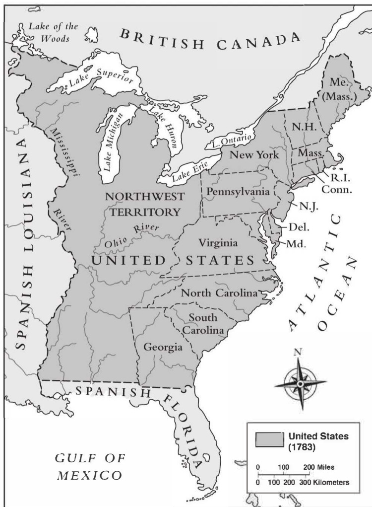
THE UNITED STATES IN 1783

Structure of Government The Articles established a central government that consisted of just one body, a congress. In this unicameral (one-house) legislature, each state was given one vote, with at least 9 votes out of 13 required to pass important laws. Amending the Articles required a unanimous vote. A Committee of States, with one representative from each state, could make minor decisions when the full congress was not in session.