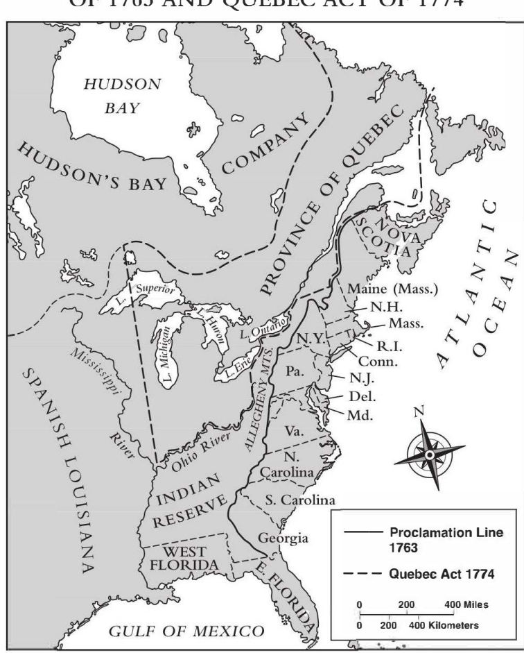
BRITISH COLONIES: PROCLAMATION LINE OF 1763 AND QUEBEC ACT OF 1774

The colonists viewed the Quebec Act as a direct attack on the American colonies because it took away lands that they claimed along the Ohio River. They also feared that the British would attempt to enact similar laws in America to take away their representative government. The predominantly Protestant Americans also resented the recognition given to Catholicism.