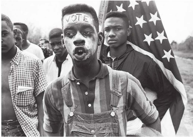
Selma to Montgomery march, 1965

Questions 4–5 refer to the photograph below.