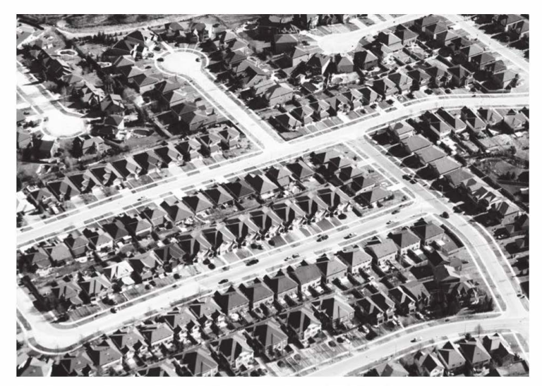
Levittown, Long Island, New York, c. 1948.