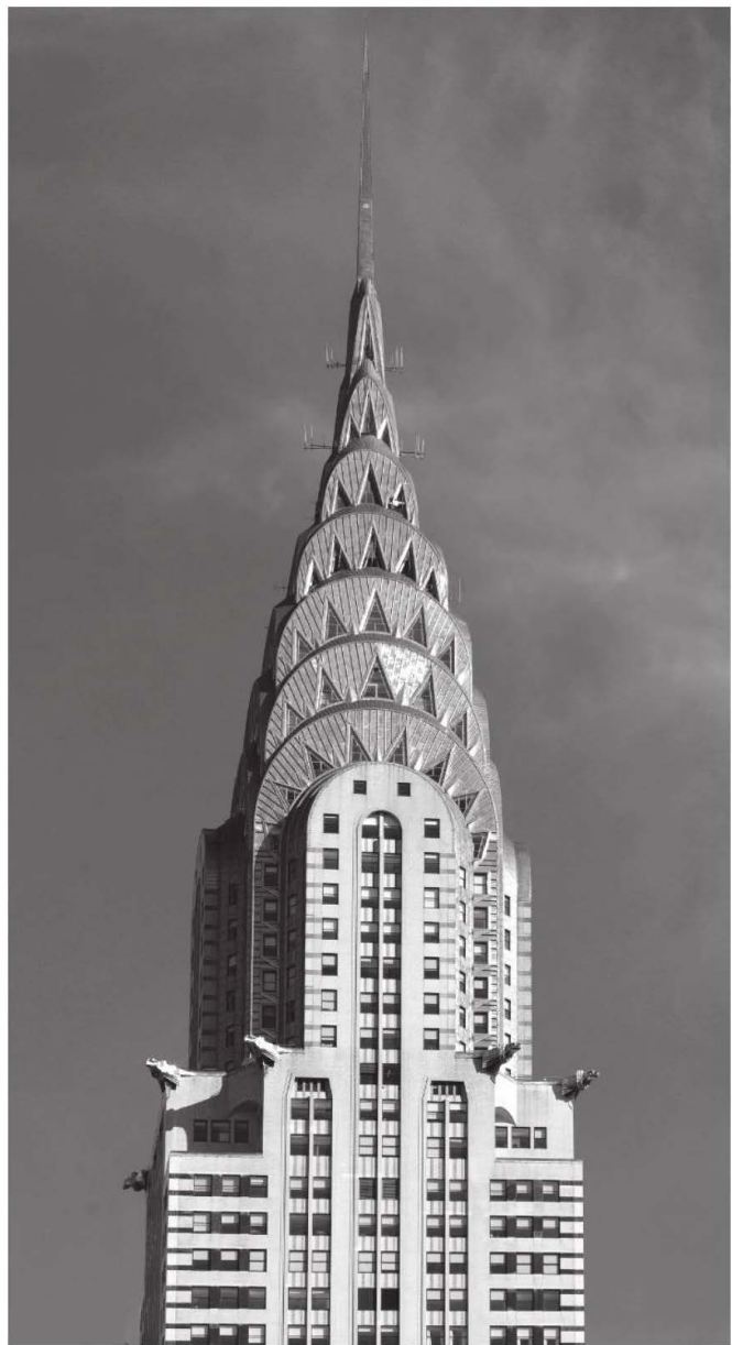
The Chrysler Building, New York City

By 1930, almost 20 percent of African Americans lived in the North, as migration from the South continued. In the North, African Americans still faced discrimination in housing and jobs, but they found at least some improvement in their earnings and material standard of living. The largest African American community developed in the Harlem section of New York City. With a population of almost 200,000 by 1930, Harlem became famous in the 1920s for its