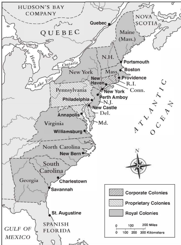
THE THIRTEEN ENGLISH COLONIES AROUND 1750

As a reward for helping him gain the throne, Charles II granted a huge tract of land between Virginia and Spanish Florida to eight nobles, who in 1663 became the lord proprietors of the Carolinas. In 1729, two royal colonies, South Carolina and North Carolina, were formed from the original grant.