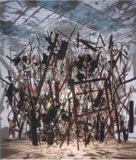
▲ Cold Dark Matter: An Exploded View (1991) by the English sculptor Cornelia Parker is a postmodern art installation.

postmodernism an artistic movement that emerged in the 1980s; its artists do not expect rationality in the world and are comfortable with many “truths”