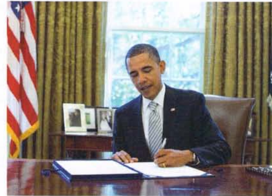
▲ U.S. president Barack Obama served two terms in the White House.

Describing What role did the economy play in U.S. presidential administrations in the 1990s and 2000s?