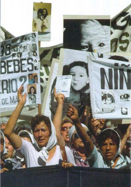
▲ The Mothers of the Plaza de Mayo, mothers and grandmothers of the desaparecidos (the disappeared) of Argentina's "dirty war," demonstrate outside La Casa Rosada in Buenos Aires.

In 1943, during World War II, a group of army officers overthrew the oligarchy. The new regime was not sure how to deal with the working classes. Juan Perón devised a new strategy. Using his position as labor secretary in the military government, Perón sought to win over the workers, known as the descamisados (the shirtless ones). He encouraged them to join labor unions and increased job benefits.