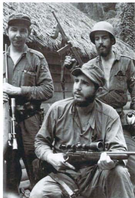
▲ Fidel Castro and two guerillas at their mountain hideout during the insurgency against Cuban dictator Fulgencio Batista.

privatization the sale of government-owned companies to private firms