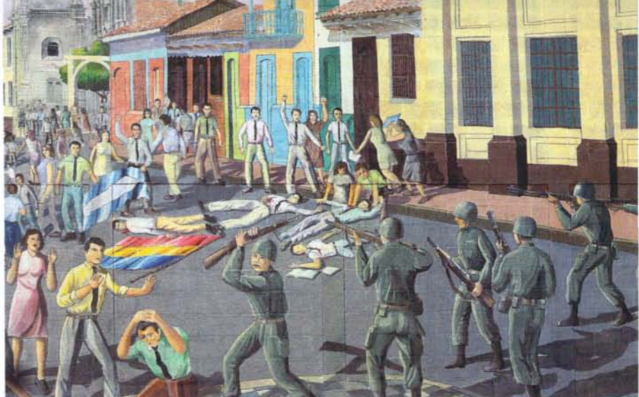
▲ This Nicaraguan mural depicts the killing of four students at an anti-Somoza protest on July 23, 1959.

The war waged by the contras undermined support for the Sandinistas. In 1990 the Sandinistas, led by Daniel Ortega, agreed to free elections and lost to a coalition headed by Violeta Barrios de Chamorro, who became Nicaragua's first female president.