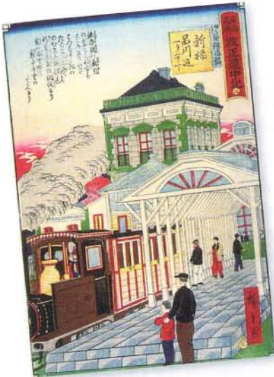
▲ Japanese artist Hiroshige III created this woodblock print of the Tokyo-Yokohama railway just years after the Meiji Restoration opened the door to Western trade and ideas.

The final result was a political system that was democratic in form but authoritarian in practice. Although modern in external appearance, it was still traditional because power remained in the hands of a ruling oligarchy (the Sat-Cho leaders). The system allowed the traditional ruling class to keep its influence and economic power.