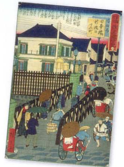
▲ These woodblock prints are part of a series called "Famous Places on the Tokaido: A Record of the Process of Reform" (1875).