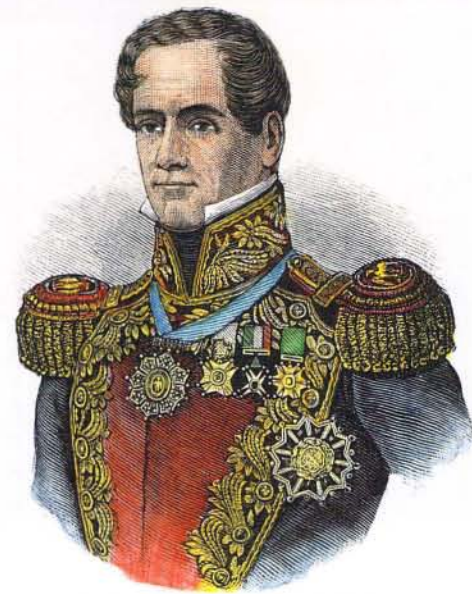
▲ Mexican General Antonio López de Santa Anna

Identifying Central Issues Why did Latin American countries continue to experience economic dependence after achieving political independence?