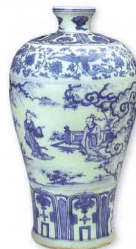
▲ Porcelain vase from the Ming Dynasty, fifteenth century

Based on what you have read, does this seem like a fair assessment of the role of women in China?