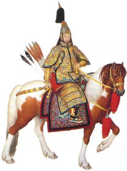
▲ Emperor Qianlong, in full ceremonial armor

A feature of Chinese society that restricted the mobility of women was the practice of footbinding. Scholars believe it began among the wealthy and was later adopted by all classes. Bound feet were a status symbol. Women who had bound feet were more marriageable than those who did