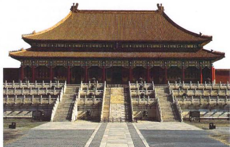
▼ A section of the Imperial City in Beijing, China

The overthrow of the Ming dynasty created an opportunity for the Manchus. They were a farming and hunting people who lived northeast of the Great Wall in the area known today as Manchuria. The forces of the Manchus conquered Beijing, and Li Zicheng’s army fell. The victorious Manchus then declared the creation of a new dynasty called the Qing (CHIHNG), meaning “pure.” This dynasty, created in 1644, remained in power until 1911.