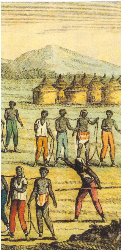
▲ The growing demand for labor in the Americas fueled the slave trade in Africa. In this image, caravans of enslaved Africans are led by local slave traders.

The slave trade had a devastating effect on some African states. The case of Benin (buh • NEEN) in West Africa is a good example. A brilliant and creative society in the sixteenth century, Benin was pulled into the slave trade. As the population declined and warfare increased, the people of