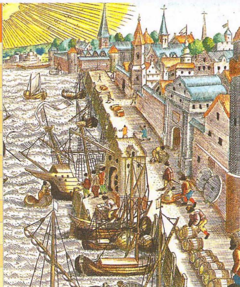
Source: Earl J. Hamilton, American Treasure and the Price Revolution in Spain, 1501–1650