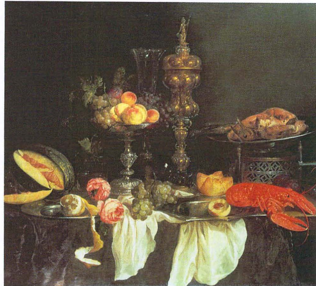
▲ Turkey and citrus fruits show the range of Dutch trade.

Drawing Conclusions How was the Dutch form of mercantilism different from that of Portugal or Spain?