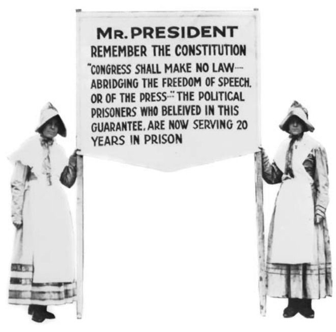
Women picketed in front of the White House, urging President Warren Harding to release political radicals arrested during his administration.

In 1925 Benjamin Gitlow was convicted of violating New York's sedition law—a law similar to the federal Sedition Act of 1918—by passing out some leaflets. The Supreme Court upheld his conviction but added, as we have seen, a statement that changed constitutional history: freedom of speech and of the press were now among the "fundamental personal rights" protected by the due-process clause of the Fourteenth Amendment from infringements by state action. Thereafter state laws involving speech, the press, and peaceful assembly were struck down by the Supreme Court for being in violation of the freedom-of-expression guarantees of the First Amendment, made applicable to the states by the Fourteenth Amendment.