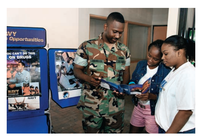
Students at a high school talk to a military recruiter.