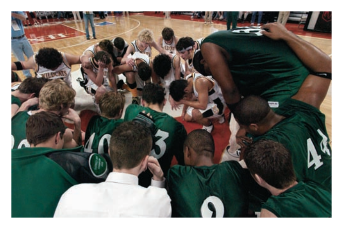
Two opposing high school basketball teams pray together after a game.

Unfortunately some conflicts between religious belief and public policy are even more difficult to settle. What if you believe on religious grounds that war is immoral? The draft laws have always exempted a conscientious objector from military duty, and the Court has upheld such exemptions. But the Court has gone further: it has said that people cannot be drafted even if they do not believe in a Supreme Being or belong to any religious tradition, so long as their "consciences, spurred by deeply held moral, ethical, or religious beliefs, would give them no rest or peace if they allowed themselves to become part of an instrument of war." Do exemptions on such grounds create an opportunity for some people to evade the