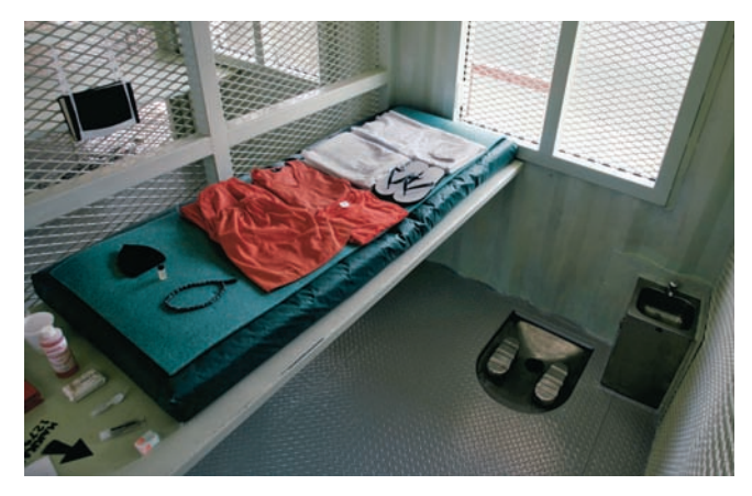
Inside a cell at the terrorist prison in Guantanamo, where Muslim inmates receive a copy of the Koran, a chess set, and an arrow pointing toward Mecca.

The biggest legal issue created by this country's war on terrorism is whether the people we capture can be held by our government without giving them access to the courts. The traditional view, first announced during World War II, was that spies sent to