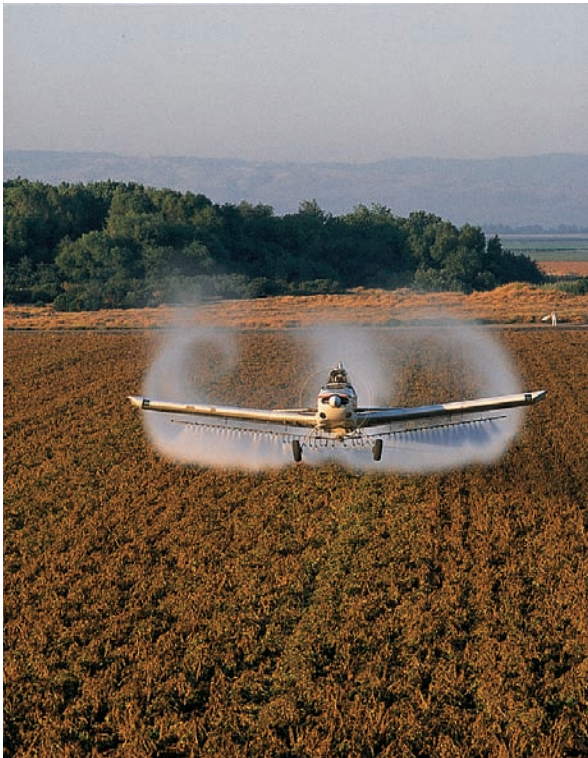
Pesticides help grow better crops, but some worry they may harm the environment.

much harder to dramatize than, say, the discovery of a toxic waste dump like that at Love Canal, New York.