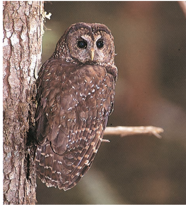
Environmentalists have used the protection of endangered species, such as the spotted owl, as a way of reducing timber harvests.

But even if the science were easy, the politics would not be. American farmers are the most productive in the world, and most of them believe that they cannot achieve that output (and thus their present incomes) without using pesticides. These farmers are well organized to express their interests and well represented in Congress (especially on the House and Senate Agricultural Committees). Complicating matters is the fact that the subsidies the taxpayers give to farmers often encourage them to produce more food than they can sell and thus to use more pesticides than they really need. Though many of these chemicals do not remain in the crops that are harvested, large amounts sink into the soil, contaminating water supplies. But these problems are largely invisible to the public and are