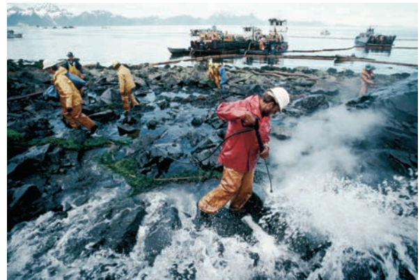
Workers clean up oil spilled by the Exxon Valdez after it grounded on Bligh Reef in Alaska’s Prince William Sound in 1989.

What Are the Costs and Benefits? Everyone wants a healthy environment, but people do not distinguish accurately between realistic and unrealistic threats or between reasonable and unreasonable costs. The biggest scare is cancer, even though every form of cancer has been steadily declining for many years (except lung cancer, which is caused primarily by smoking, not environmental hazards). People fear the unknown—many are afraid of flying, for example, even though flying is vastly safer than driving. People fear strange threats, such as toxic chemicals, even though they may never hurt anyone. People applaud dramatic governmental steps without asking whether they actually help anyone. For example, the government has mandated that