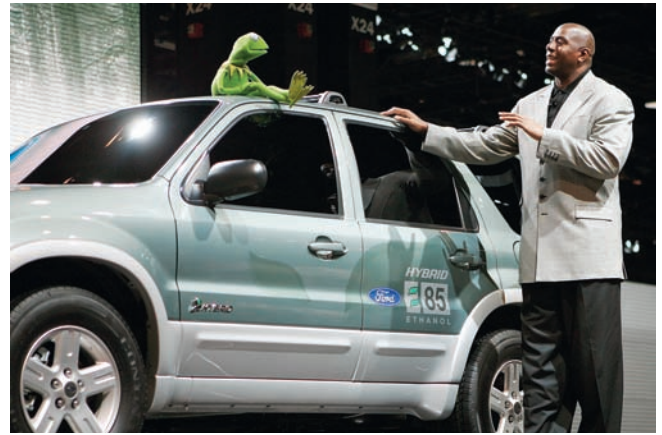
Kermit the Frog and Magic Johnson display a new hybrid automobile from Ford.

Most clean-air laws passed since 1990 have targeted particular industries. For example, in 2004 the Bush administration approved a new measure to dramatically reduce emissions from heavy-use diesel engines used in construction, agricultural, and other industrial machinery. The public will support such tough environmental laws when somebody else pays or when