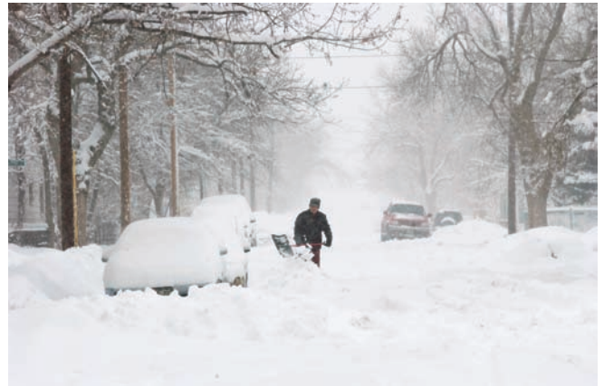
Heavy snow blankets Lafayette, Colorado.

The phrase means that gases, such as carbon dioxide, produced by people when they burn fossil fuels—wood, oil, or coal—get trapped in the atmosphere and cause the earth's temperature to rise. When the