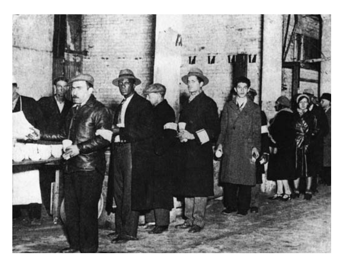
In 1932, unemployed workers line up at a soup kitchen during the Great Depression.

The election of 1932 produced an overwhelming congressional majority for the Democrats and placed Franklin D. Roosevelt in the White House, Almost