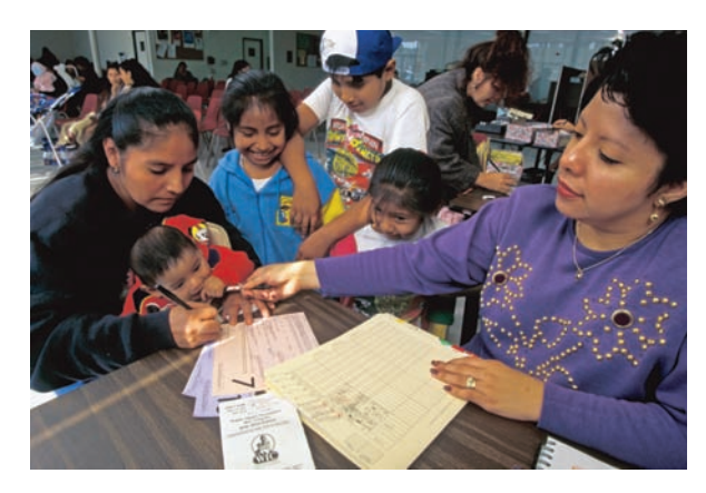
A girl looks on as her mother displays food stamps.

One possible cure is to get rid of Medicare and instead have doctors and hospitals work for the government. That is done in several countries, and as a result the citizens of these countries pay less for health care than do U.S. citizens (see Table 19.2). But