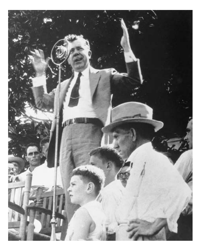
In 1934, Huey Long, the popular governor of Louisiana, claimed that Roosevelt was not doing enough to help the common man. But before he could become a serious threat to Roosevelt in the 1936 election, he was assassinated in 1935.

immediately a number of emergency measures were adopted to cope with the depression by supplying federal cash to bail out state and local relief agencies and by creating public works jobs under federal auspices. These measures were recognized as temporary expedients, however, and were unsatisfactory to those who believed that the federal government had a permanent and major responsibility for welfare. Roosevelt created the Cabinet Committee on Economic Security to consider long-term policies. The committee drew heavily on the experience of European nations and on the ideas of various American scholars and social workers, but it understood that it would have to adapt these proposals to the realities of American politics. Chief among these was the widespread belief that any direct federal welfare program might be unconstitutional. The Constitution nowhere explicitly gave to Congress the authority to set up an unemployment compensation or old-age retirement program. And even if a welfare program were constitutional,