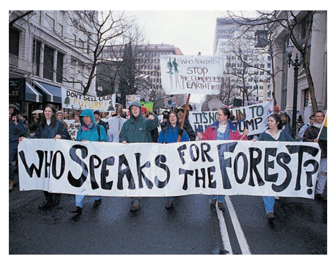
The greater the activity of government—for example, in regulating the timber industry—the greater the number of interest groups.

not emerge until 1910. Men and women worked in factories for decades before industrial unions were formed.