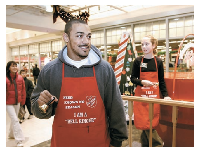
A Green Bay Packers linebacker solicits money for the Salvation Army.