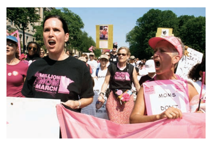
The Million Moms March in 2004 demanded a federal ban on assault weapons.

There have been several feminist social movements in this country's history—in the 1830s, in the 1890s, in