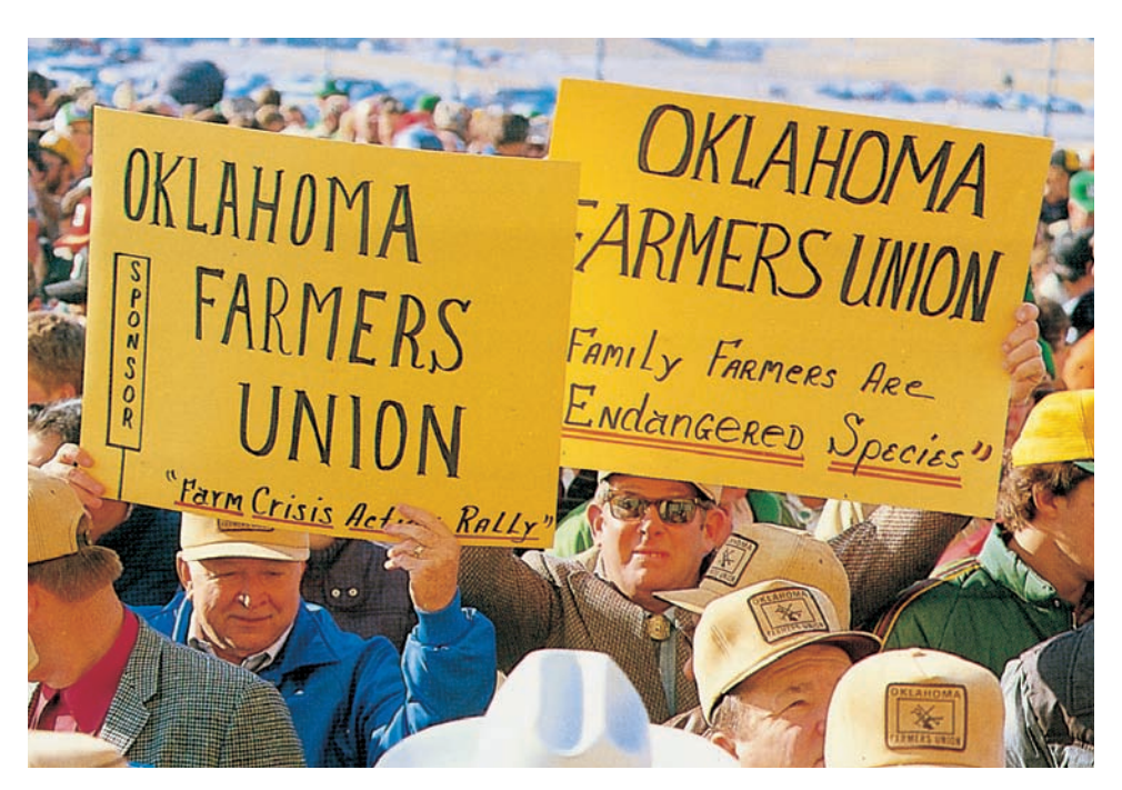
Farmers once had great influence in Congress and could get their way with a few telephone calls. Today they often must use mass protest methods.

Whenever American politics is described as having an upper-class bias, it is important to ask exactly what this bias is. Most of the major conflicts in American politics—over foreign policy, economic affairs, environmental protection, or equal rights for women—are conflicts within the upper middle class; they are conflicts, that is, among politically active elites. As we