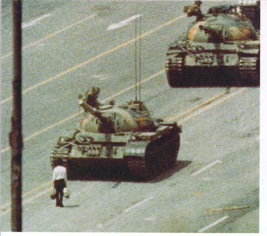
A demonstrator stands in front of the tanks at Tiananmen Square.