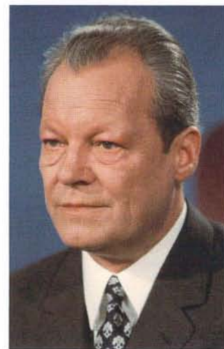
▲ West German chancellor Willy Brandt