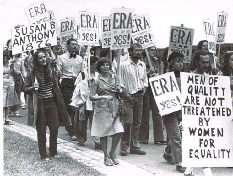
▲ Men and women march together at an Equal Rights Amendment (ERA) rally in Pittsburgh, Pennsylvania, in 1976.

Summarizing What was a goal of the women's liberation movement?