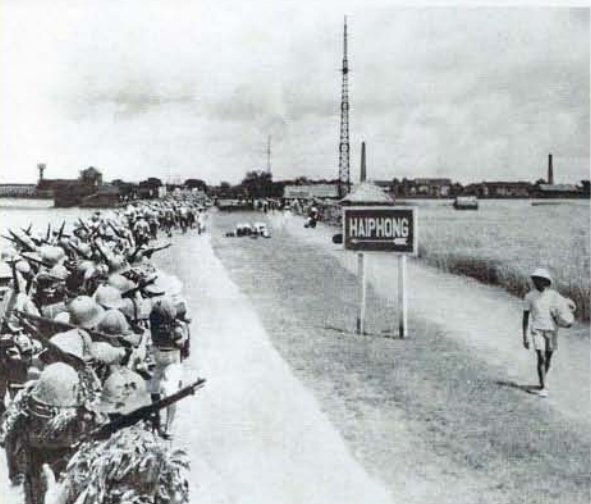
▲ Japanese troops arrive at Haiphong Port in Indochina

death camps, they chose to concentrate on ending the war. Not until after the war did the full extent of the horror and inhumanity of the Holocaust impress itself upon people's consciousness.