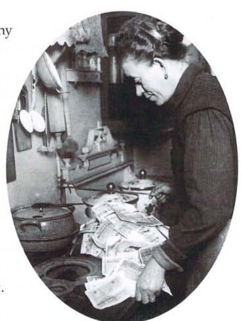
▲ This woman uses German marks to light her stove during the Great Depression.