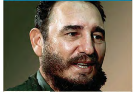
Fidel Castro 1926–

The son of a wealthy Spanish-Cuban farmer, Fidel Castro became involved in politics at the University of Havana. He first tried to overthrow the Cuban dictator, Batista, in 1953. He was imprisoned, but vowed to continue the struggle for independence: