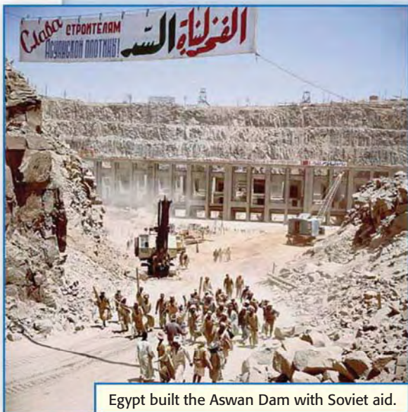
Egypt built the Aswan Dam with Soviet aid.

During the Cold War, the United States and the Soviet Union both believed that they needed to stop the other side from extending its power. What differentiated the Cold War from other 20th century conflicts was that the two enemies did not engage in a shooting war. Instead, they pursued their rivalry by using the strategies shown below.