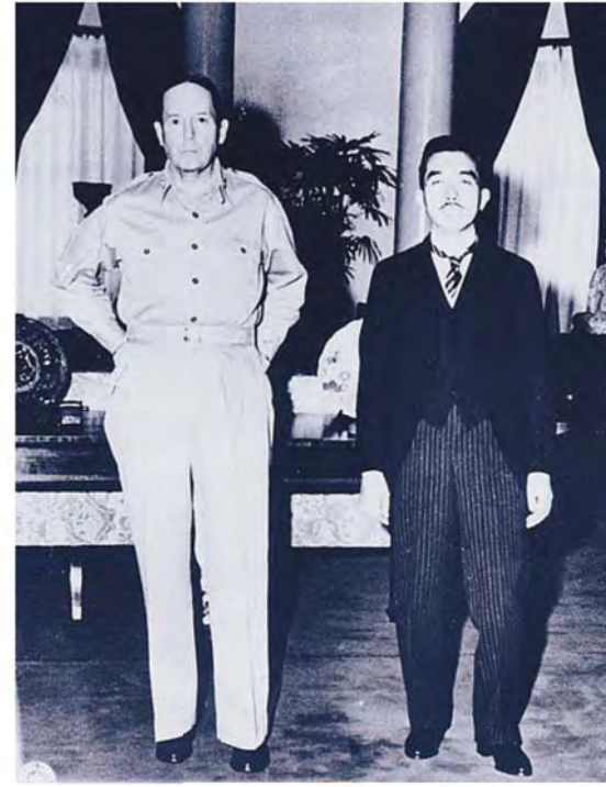
▲ Emperor Hirohito and U.S. General Douglas MacArthur look distant and uncomfortable as they pose here.

In the postwar world, enemies not only became allies. Sometimes, allies became enemies. World War II had changed the political landscape of Europe. The Soviet Union and the United States emerged from the war as the world's two major powers. They also ended the war as allies. However, it soon became clear that their postwar goals were very different. This difference stirred up conflicts that would shape the modern world for decades.