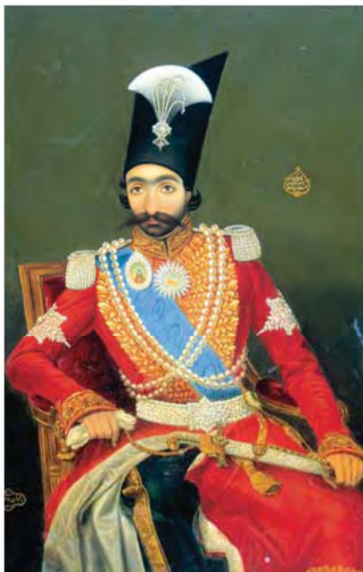
▲ Nasir al-Din was killed by one of al-Afghani's followers a few years after the boycott.

Battle over Tobacco Tension arose between the often corrupt rulers, who wanted to sell concessions to Europeans, and the people. The people were often backed by religious leaders who feared change or disliked Western influence in their nation. In 1890, Persian ruler Nasir al-Din sold a concession to a British company to export Persian tobacco. This action outraged Jamal al-Din al-Afghani, a leader who supported the modernization of Persia. He helped set up a tobacco boycott by the heavy-smoking Persians. In the following quote, he expresses his contempt for the Persian ruler: