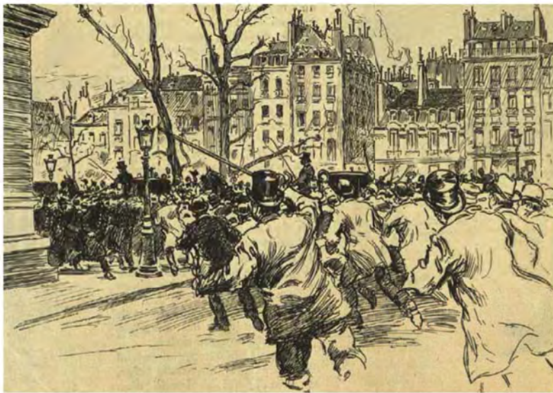
▲ This engraving from an 1898 French magazine shows Émile Zola being surrounded by an anti-Semitic mob.

In 1894, Captain Alfred Dreyfus, one of the few Jewish officers in the French army, was accused of selling military secrets to Germany. A court found him guilty, based on false evidence, and sentenced him to life in prison. In a few years, new evidence showed that Dreyfus had been framed by other army officers.