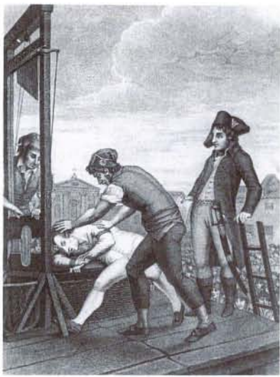
▲ Execution of Robespierre on July 28, 1794