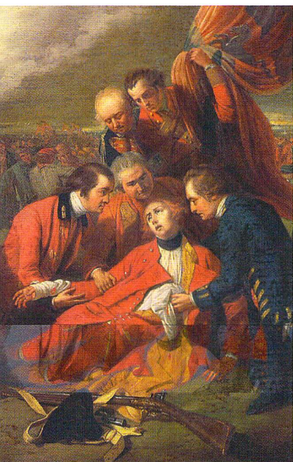
▲ This painting by Benjamin West shows the death of the British General James Wolfe.

Explaining Explain the involvement of Great Britain and France in the Seven Years' War.