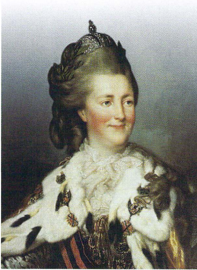
▲ Catherine II (Catherine the Great) was a strong Russian ruler.

The eighteenth-century monarchs were concerned with the balance of power. This concept meant that states should have equal power in order to prevent any one from dominating the others. Large armies created to defend a state's security, however, were often used to conquer new lands as well. As Frederick II of Prussia said, "The fundamental rule of governments is the principle of extending their territories." This rule led to two major wars in the eighteenth century.