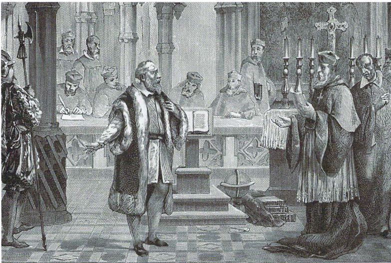
▲ Galileo appears before officials in the Vatican in 1663.

In spite of the Church's position, by the 1630s and 1640s, most astronomers had accepted the heliocentric idea of the universe. However, motion in the universe had not been explained. The ideas of Copernicus, Kepler, and Galileo had yet to be tied together. An Englishman—Isaac Newton—would make this connection; he is considered the greatest genius of the Scientific Revolution.