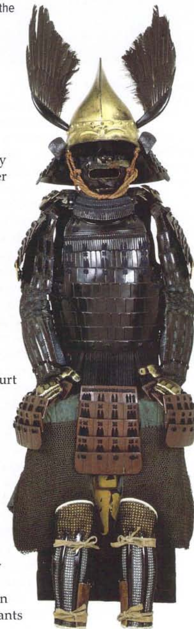
▲ Eighteenth-century Japanese samurai armor

community a group of people with common interests and characteristics living together within a larger society