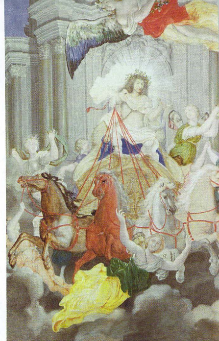
▲ Triumph of King Louis XIV of France driving the Chariot of the Sun preceded by Aurora, by Joseph Werner

The Austrian Hapsburgs had long played a significant role in European politics as emperors in the Holy Roman Empire. By the end of the Thirty Years' War, their hopes of creating an empire in Germany had been dashed. In the seventeenth century, however, the Hapsburgs created a new empire in eastern and southeastern Europe.