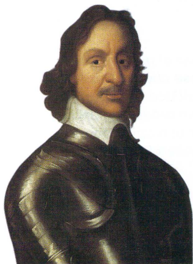
▲ Oliver Cromwell, Lord Protector of England during the Commonwealth

Roundheads supporters of Parliament in the English Civil War