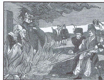
▲ Witch-burning in the County Reinstein (Regenstein, Saxony-Anhalt, Germany) in 1555

By 1650, the witchcraft hysteria had begun to lessen. As governments grew stronger, fewer officials were willing to disrupt their societies with