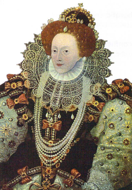
▲ Queen Elizabeth I of England

policy an overall plan embracing the general goals and acceptable procedures of a governmental body