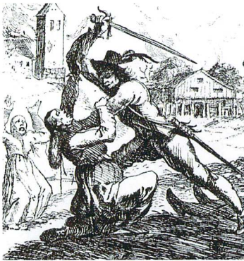
▲ A villager is attacked by a soldier during the Thirty Years' War.

Stating Was the original motivation for the Thirty Years' War political or religious?