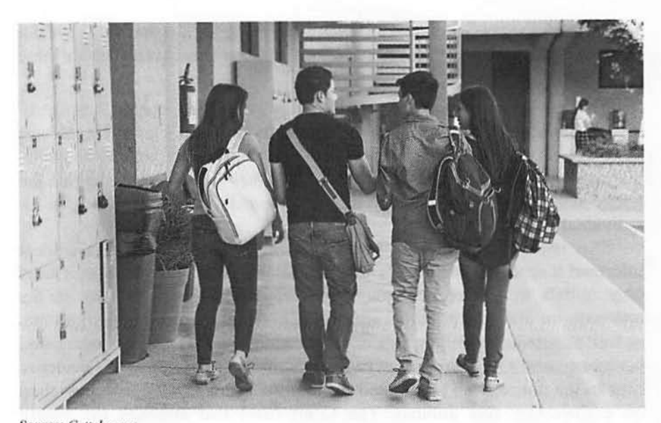
What is the current national legal standard for a school official to conduct a search of a student's locker, backpack, or person?

Erring on the Side of Warrants In other recent Fourth Amendment rulings the U.S. Supreme Court has extended protections regarding cell phones, GPS locators, and narcotics-sniffing dogs at a person's front door. In one case after a constitutional arrest in California, the police, in clearing a commandeered vehicle, discovered the arrestee's cell phone. They searched it and found video evidence of his membership in a gang. The challenge in the High Court questioned whether, after the arrest, law enforcement can search a suspect's phone for any general information. The Court ruled unanimously that, though police are allowed to search immediate items in the name of protecting other officers or preserving evidence, searching such comprehensive items as a cell phone and all the suspect's digital data—that which can be preserved without a search and does not pose an immediate threat—is only reasonable after a court-ordered warrant.