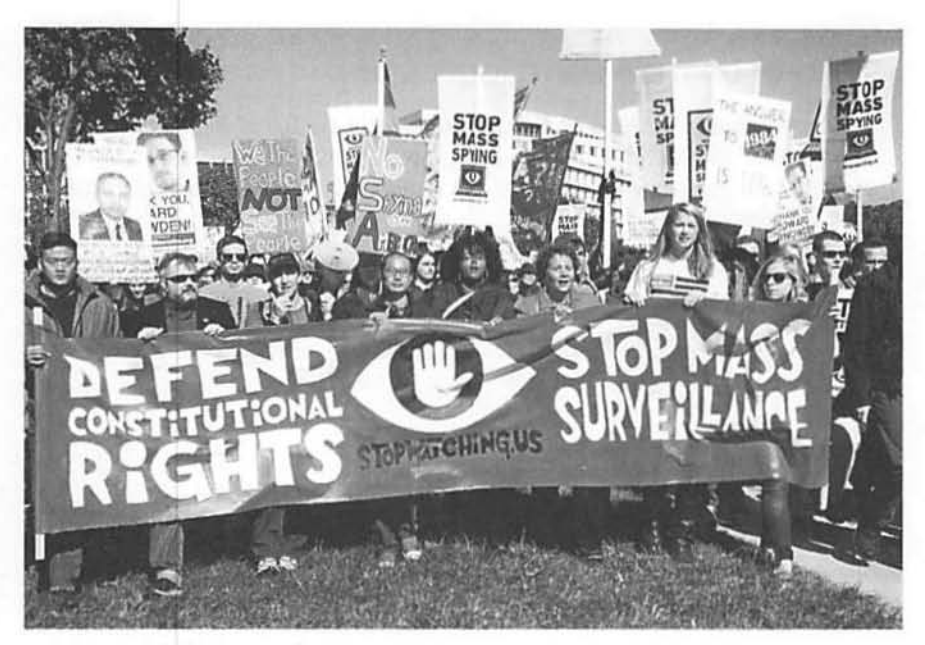
Citizens rally to protest mass surveillance policies.