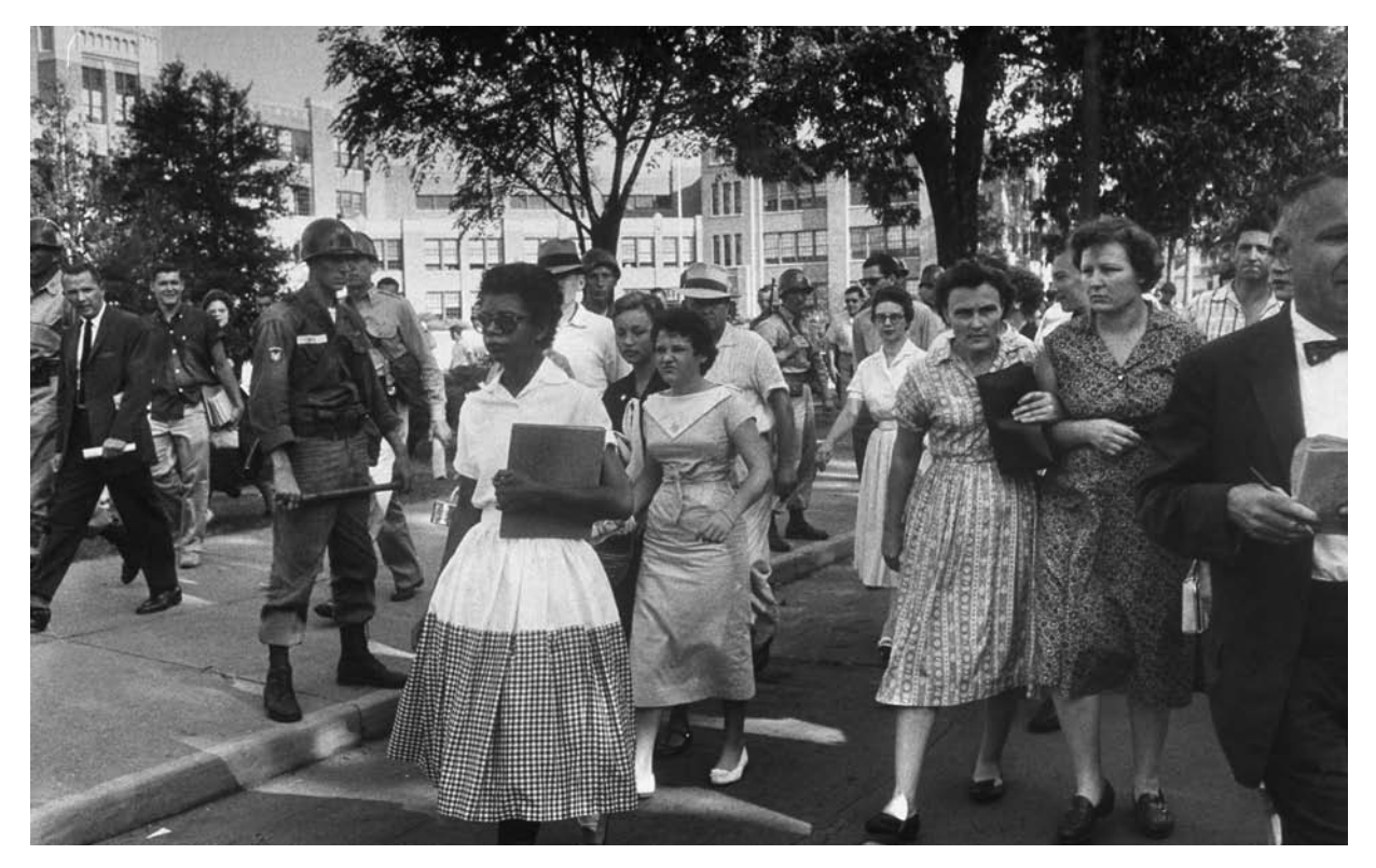
A black student being turned away from an all-white high school under the orders of Arkansas Governor Orval Faubus in 1957.

It was a risky and controversial step to take. Many states, Kansas among them, were trying to make their all-black schools equal to those of whites by