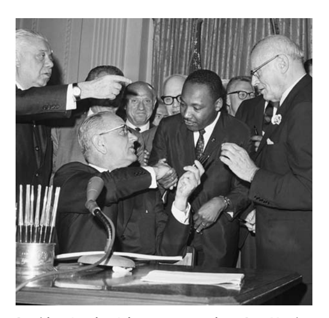
President Lyndon Johnson congratulates Rev. Martin Luther King, Jr., after signing the Civil Rights Act of 1964.

This change partly reflected the growing political strength of southern blacks. In 1960 less than one-third of voting-age blacks in the South were registered to vote; by 1971 more than half were, and by 1984 two-thirds were. In 2001 over nine thousand blacks held elective office (see Table 6.1). But this was only half of the story. Attitudes among white political elites and members of Congress had also changed. This was evident as early as 1968, when Congress passed a law barring discrimination in housing even though polls