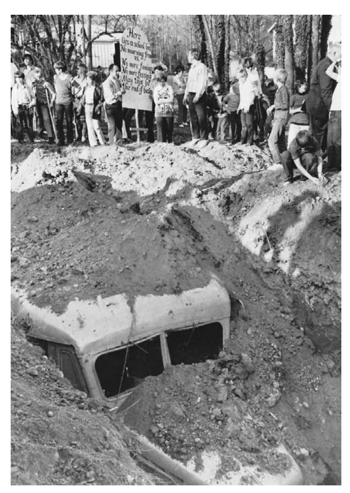
Antibusing protesters buried a school bus (unoccupied) to dramatize their cause.