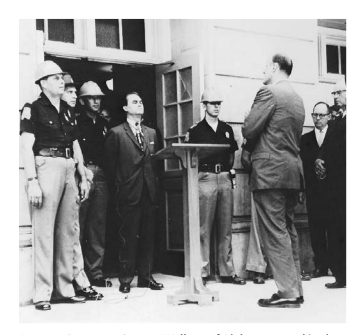
In 1963 Governor George Wallace of Alabama stood in the doorway of the University of Alabama to block the entry of black students. Facing him is U.S. Deputy Attorney General Nicholas Katzenbach.

The Rationale As the struggle to implement the Brown decision continued, the importance of the rationale for that decision became apparent. The case was decided in a way that surprised many legal scholars. The Court could have said that the equal-protection clause of the Fourteenth Amendment makes the Constitution, and thus state laws, color-blind. Or it could have said that the authors of the Fourteenth Amendment meant to ban segregated schools. It did neither. Instead it said that segregated education is bad because it "has a detrimental effect upon the colored children" by generating "a feeling of inferiority as to