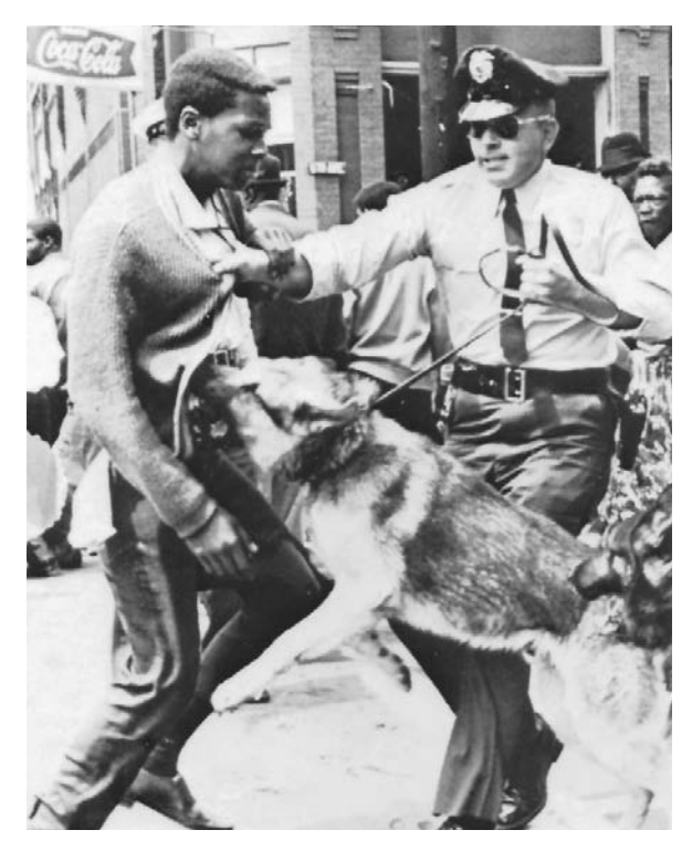
This picture of a police dog lunging at a black man during a racial demonstration in Birmingham, Alabama, in May 1963 was one of the most influential photographs ever published. It was widely reprinted throughout the world and was frequently referred to in congressional debates on the civil rights bill of 1964.

tion (which it probably realized it would lose), sent the bill to the floor, where it passed overwhelmingly. In the Senate an agreement between Republican minority leader Everett Dirksen and President Johnson smoothed the way for passage in several important respects. The House bill was sent directly to the Senate floor, thereby bypassing the southern-dominated Judiciary Committee. Nineteen southern senators began an eight-week filibuster against the bill. On June 10, 1964, by a vote of seventy-one to twentynine, cloture was invoked and the filibuster ended—the first time in history that a filibuster aimed at blocking civil rights legislation had been broken.