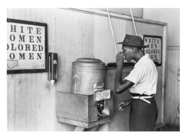
Segregated water fountains in 1939.

Although today white citizens generally do not feel threatened when a black family moves into Cicero, Illinois, a black child goes to school at Little Rock Central High School, or a black group organizes voters in Neshoba County, Mississippi, at one time most whites in Cicero, Little Rock, and Neshoba County felt deeply threatened by these things (and some whites still do). This was especially the case in those parts of the country, notably the Deep South, where blacks were often in the majority. There the politically dominant white minority felt keenly the potential competition for jobs, land, public services, and living space posed by large numbers of people of another race. But even in the North, black gains often appeared to be at the expense of lower-income whites who lived or worked near them, not at the expense of upper-status whites who lived in suburbs.