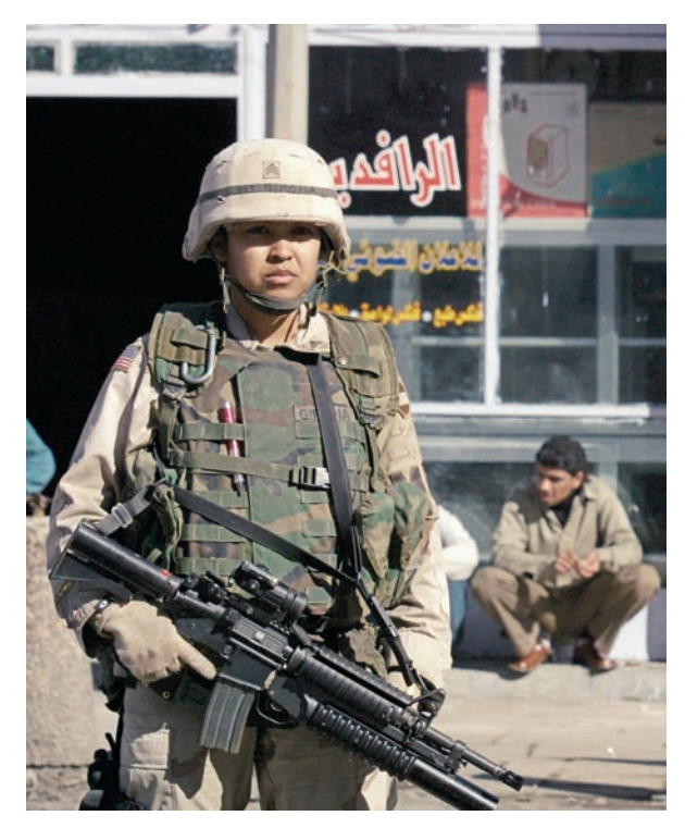
American female soldier guards an area in Baghdad where terrorists had exploded bombs.

the war, the feminist movement took flight with the publication in 1963 of The Feminine Mystique by Betty Friedan.