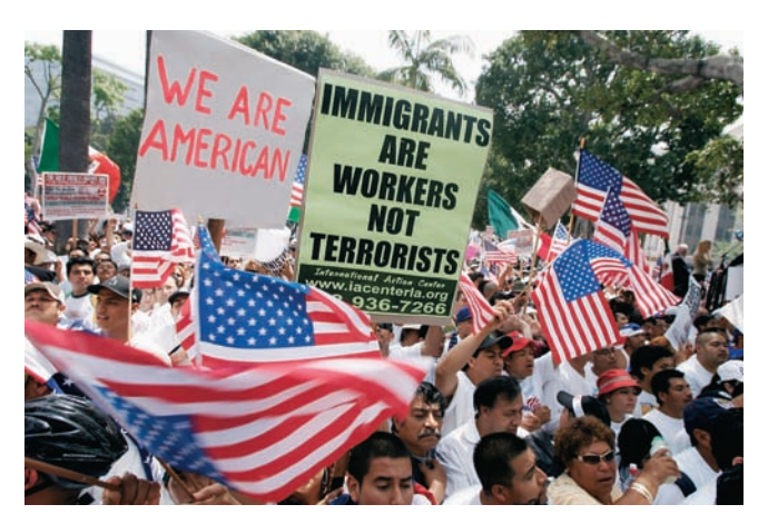
Immigrants march in Los Angeles in 2006 to show their importance to the economy.

The issue has largely been fought out in the courts. Between 1978 and 1990 about a dozen major cases involving affirmative action were decided by the Supreme Court; in about half it was upheld, and in the other half it was overturned. The different outcomes reflect two things—the differences in the facts of the cases and the arrival on the Court of three justices (Kennedy, O'Connor, and Scalia) appointed by a president, Ronald Reagan, who was opposed to at least the broader interpretation of affirmative action. As a result of these decisions, the law governing affirmative action is now complex and confusing.